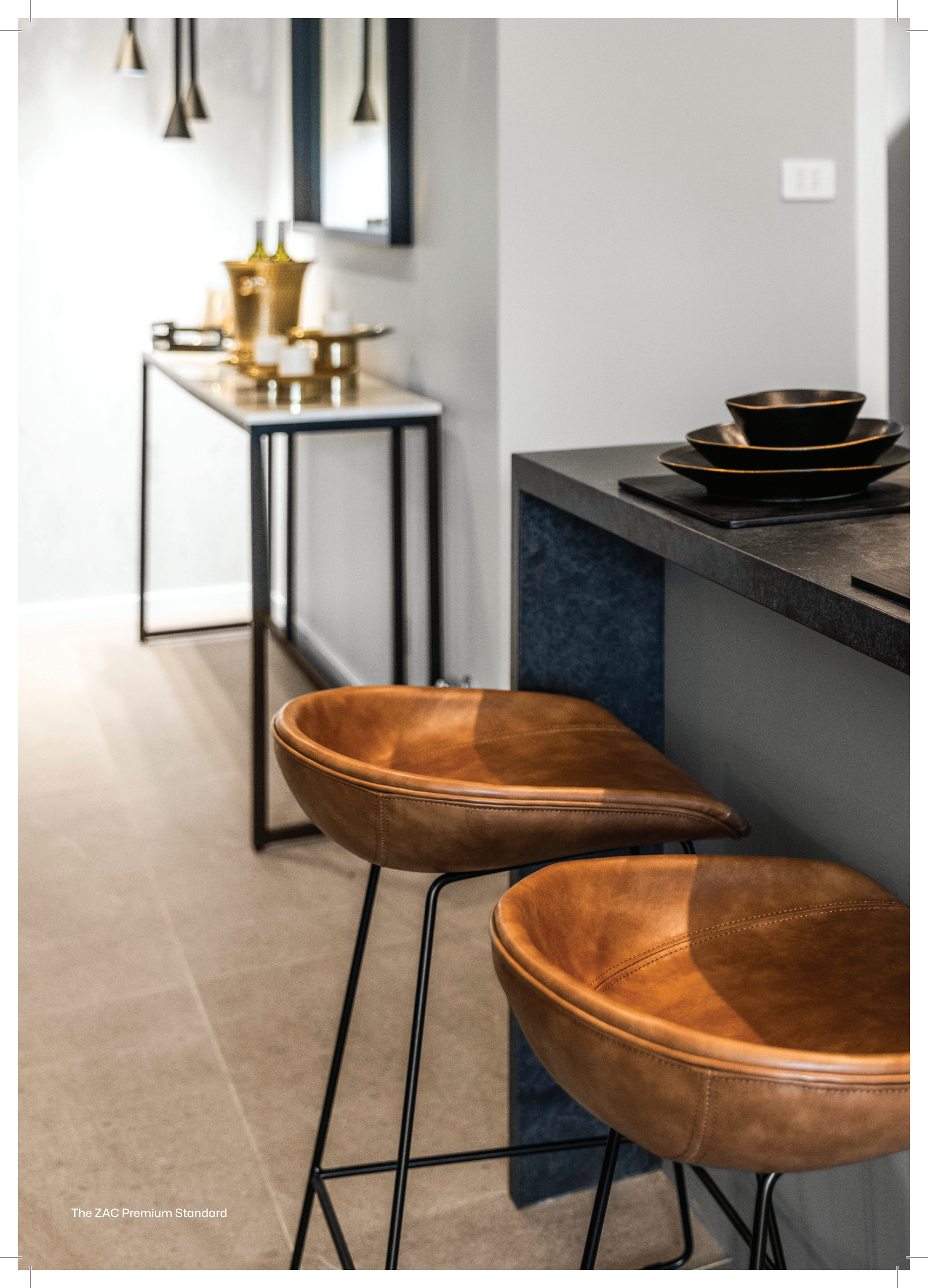
The ZAC Premium Standard