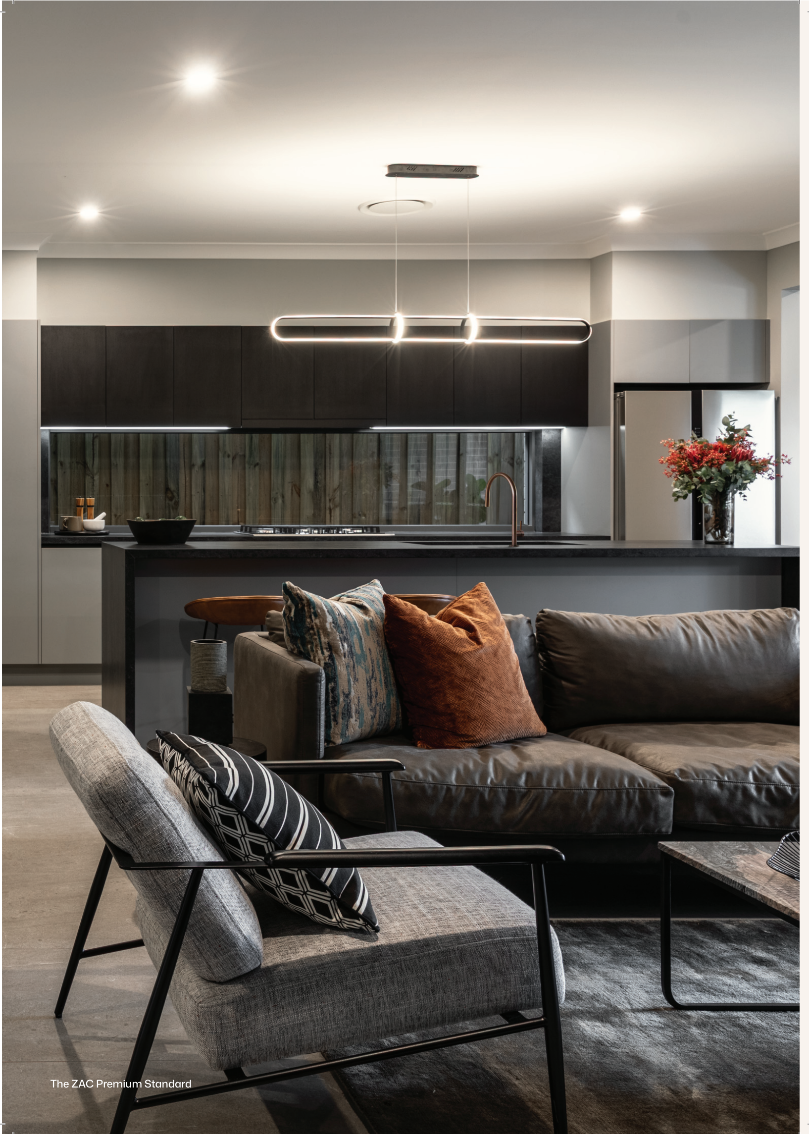
The ZAC Premium Standard