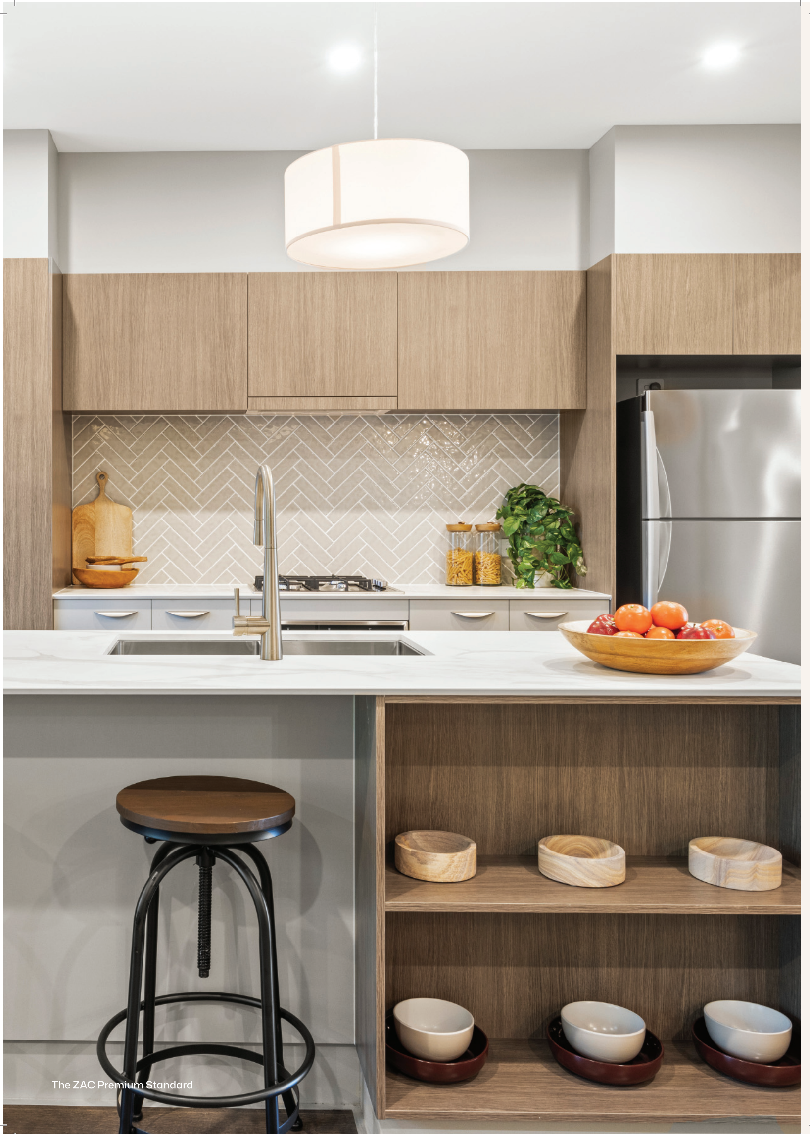
The ZAC Premium Standard